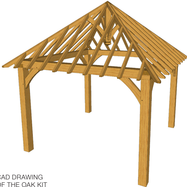
CAD DRAWING OF THE OAK KIT